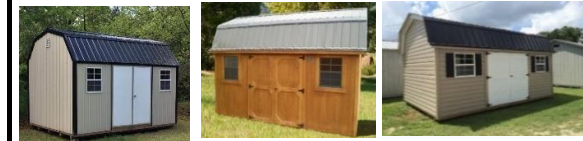
10' x 16' Amish

16" On Center Walls/Roof 1 & Floors FULLY LOADED!