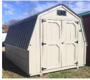
32" Wall Budget Barn (Wood Siding)