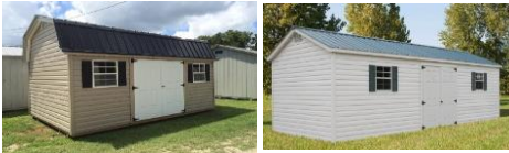
12' x 20' Vinyl Building