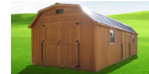
12'x28' Handiman/ Diva Den (Amish or A-Frame)

FULLY LOADED: 2 Win., 2 Workbenches, 2&1/2 Lofts, Wired, 2 Sets Dbl. Doors w/ Burglar Bars, Partition Wall